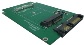
AD963FA5 for full size mSATA SSD